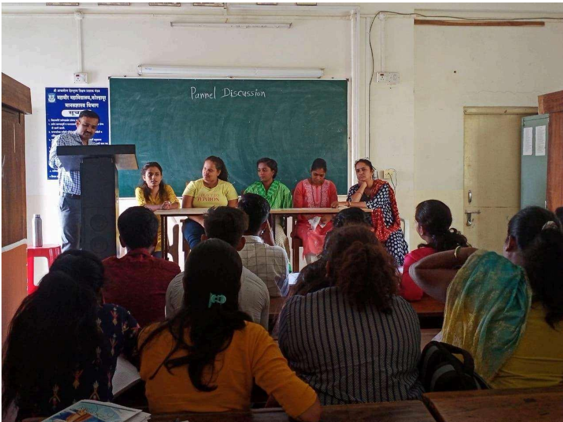
M.A. I Pannel Discussion, February, 2024