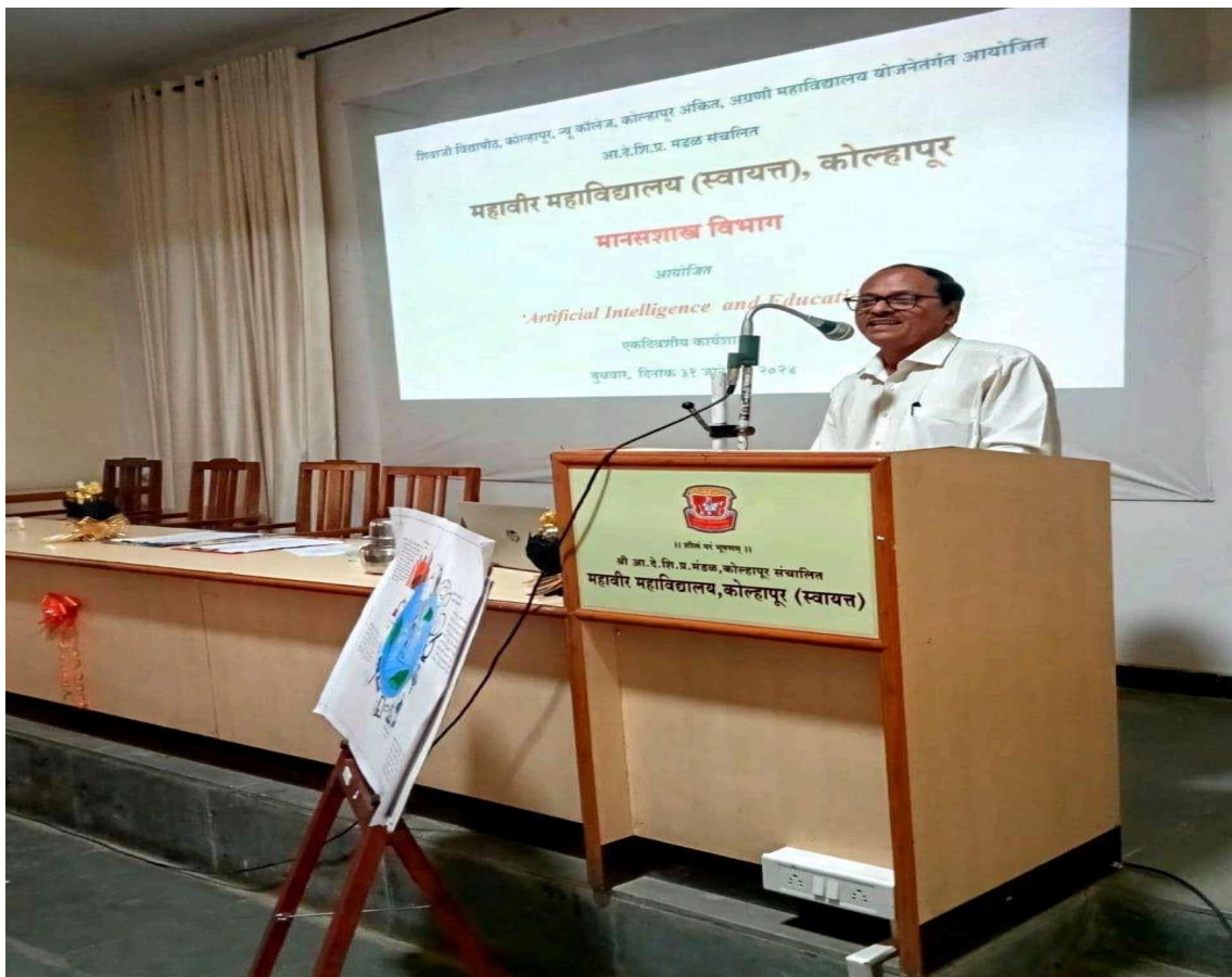
Lead college Workshop on AI and Education 31 January, 2024