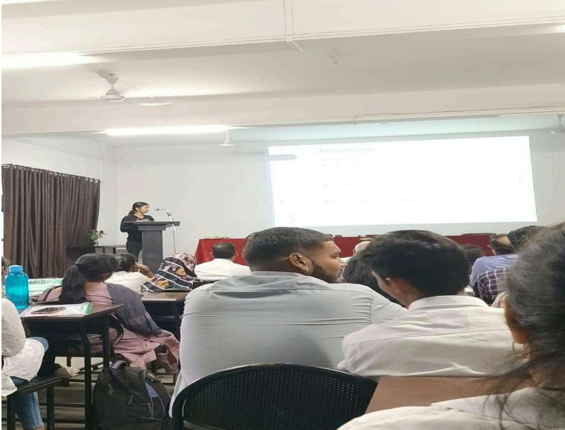
SVMP State level conference at KBP- PG Students got 1 st Prize for Paper presentation