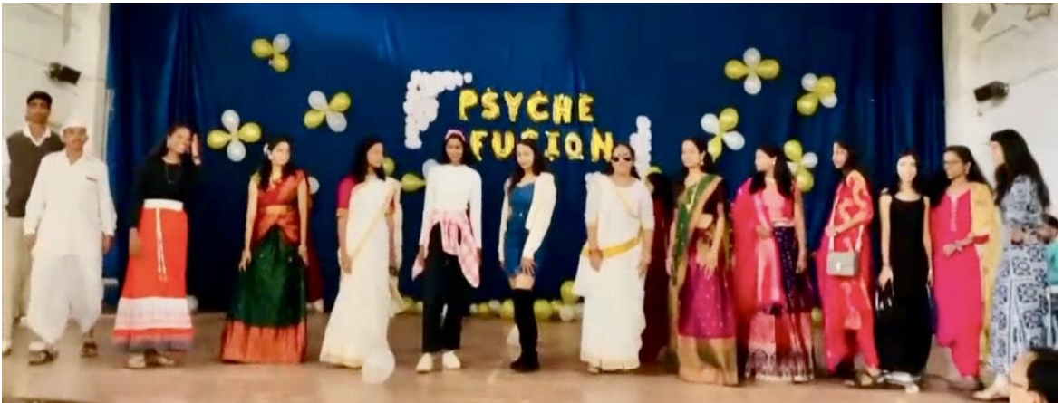
PSYCHE FUSION, फेब्रुवारी, २०२५

मानसशास्त्रातील सर्व पदवी आणि पदव्युत्तर मुले स्वयंस्फूर्तीने दरवर्षी हा उपक्रम राबवतात. यावर्षी एकांकिका, भूमिका वठवणे, नृत्य, गायन, काव्यवाचन, मिमिक्री, फॅशन शो, शेला पागोटे, गेम्स यातून मुलामुलींनी विविध गुणदर्शन घडवले.