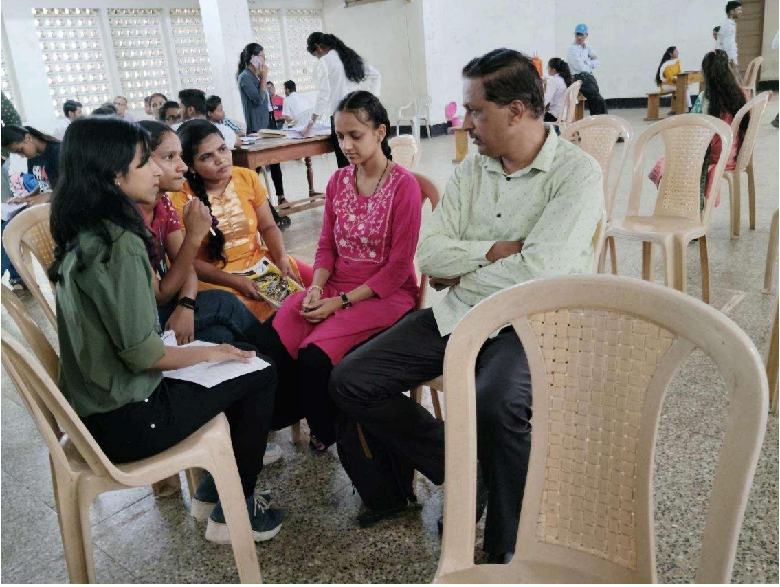
Career Exhibition 1 April, 2024