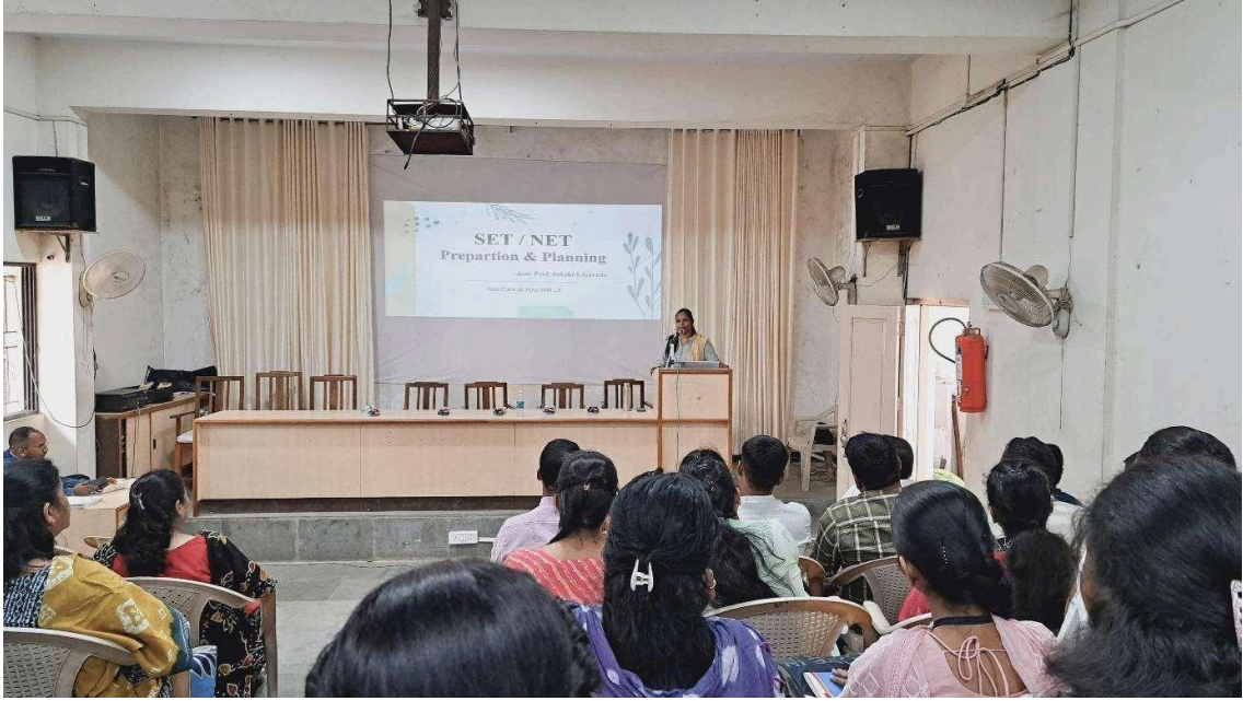
Workshop on NET/SET, 31 March, 2023