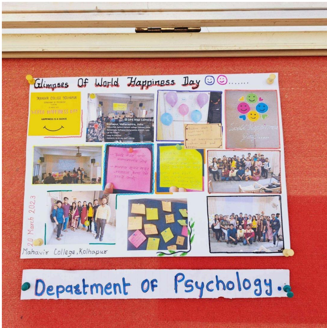
World Happiness Day, March, 2023