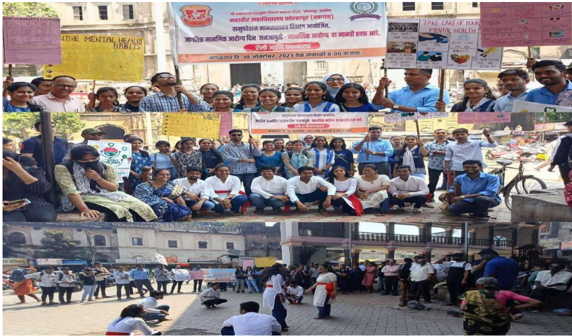
World Mental Health Day Street Play, 10 October, 2023