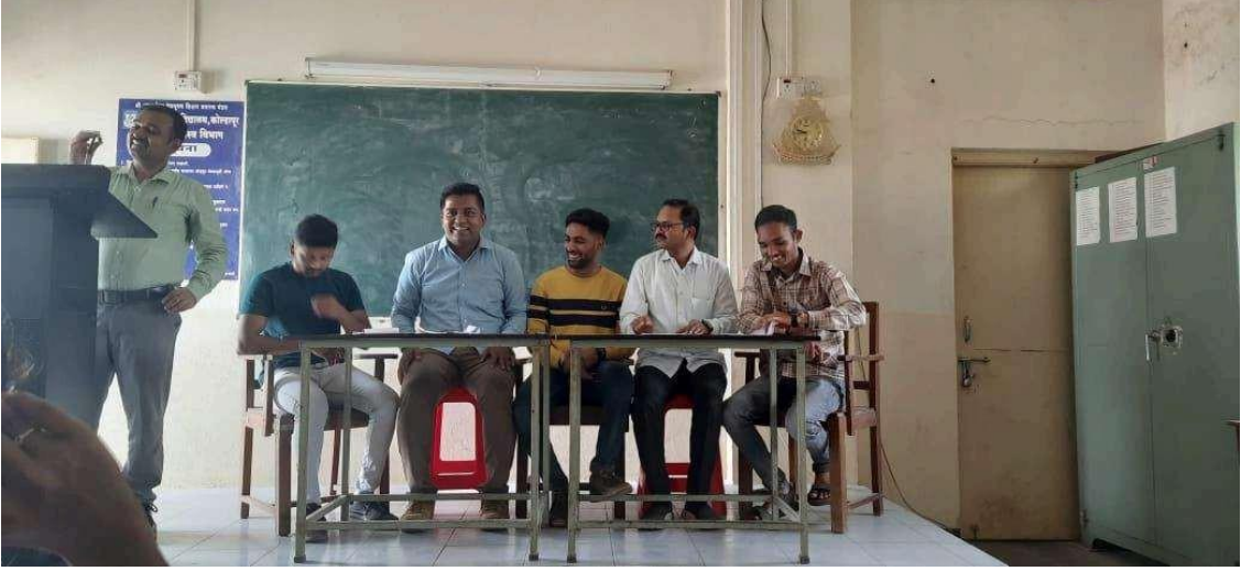
Pannel Discussion - April, 2024