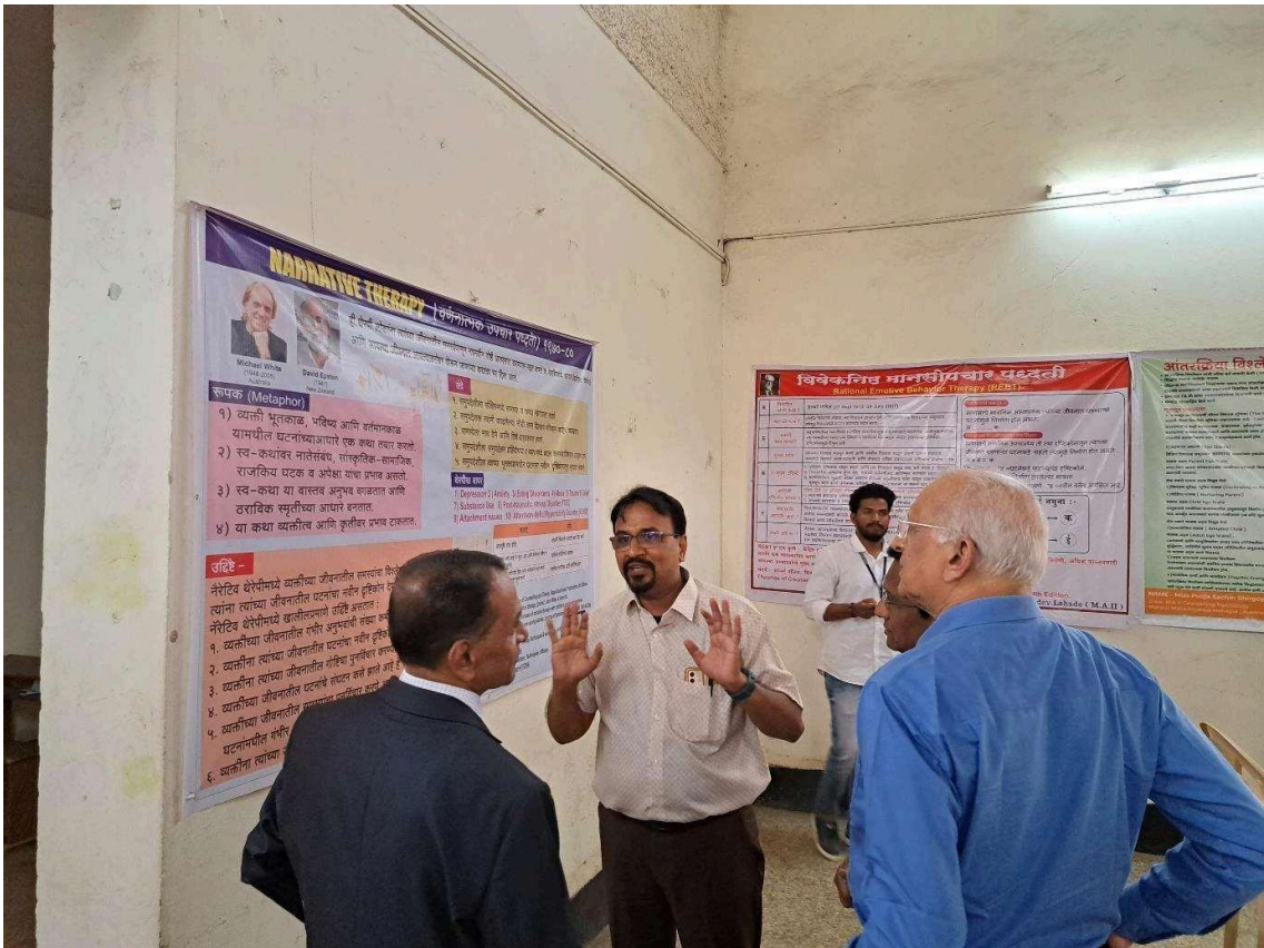
Career Exhibition, April 2023